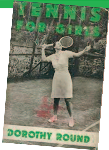
Dorothy Round's second book on tennis, published in 1938.

She was inducted into the International Tennis Hall of Fame in 1986.