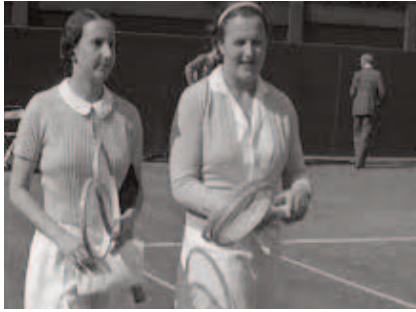
LEFT: Dorothy Round World ranked No. 1, 1934 & Betty Nuttall, ranked World No.4, 1929.